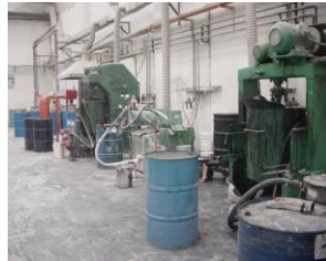
Paint production process