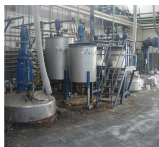
Resin production process